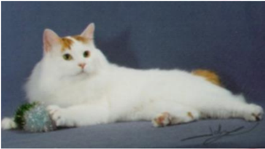
First Longhair Grand Champion (1993) First Longhair Breed Winner First Longhair Red/White Breed Winner (1994) First Red/White Grand (CH or PR) First Longhair National Winner, CH or PR Premiership (1995)