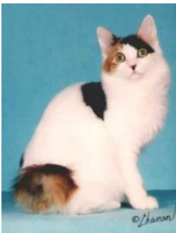
First Mi-ke Longhair Grand (1993) First Double Regional Longhair Winner in one Season (1993) First Longhair Distinguished Merit (1996)