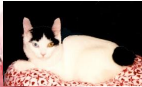
First Black/White LH Grand Champion (1995) GC Kurisumasu Kaiko Black/White Odd-eyed Male B/O: Marianne Clark