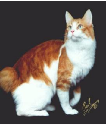
First Longhair Grand, CH or PR (1993) First Longhair Grand Premier (1993) First Longhair Red Tabby/White Grand (CH or PR) (1993) June 6, 1993